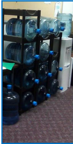
5 Gallon BW